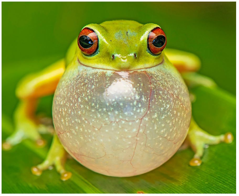
This tiny colourful Shrub Frog ( Raorchestes beddomi) belongs to the most speciose amphibian genera found in India. All members of this group exclusively undergo direct development and lack free swimming tadpoles.

when we worked with it. It is much more advanced now. Nonetheless, it became evident that Sooglossidae and Nasikabatrachidae shared an ancestry from the Gondwana times."