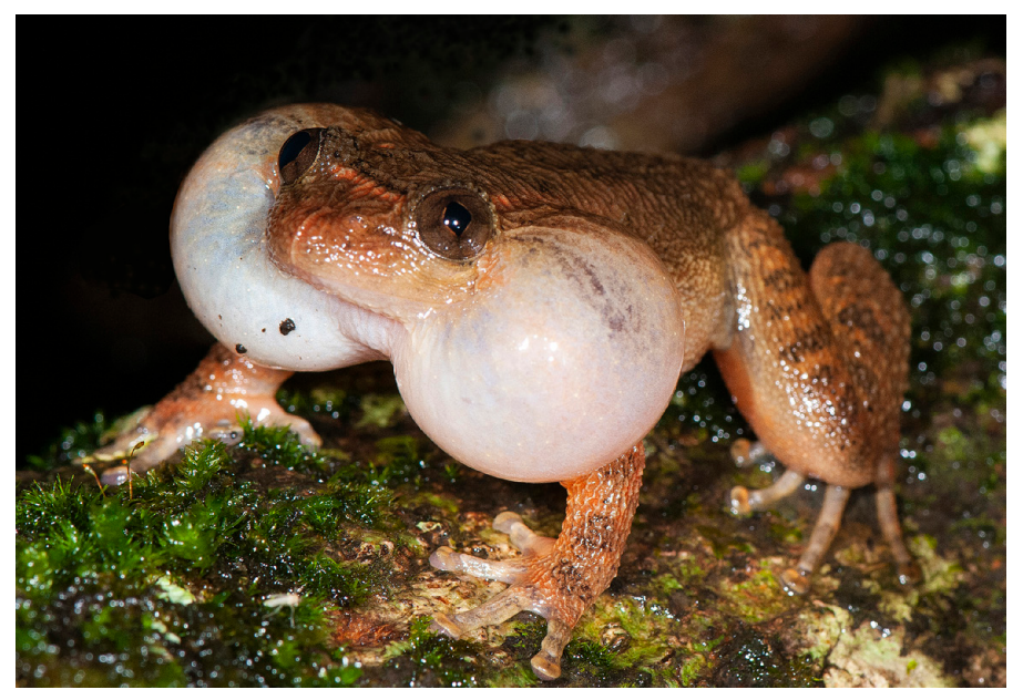
The seventh 'sex' or amplexus position in frogs - Dorsal straddle – was discovered in an Indian frog by Biju and co-researchers. The Bombay Night Frog breeds differently from all other frogs, as the female releases eggs without a male on her back. Pictured here is a male Bombay Night frog calling with the help of two inflated vocal sacs to attract a female for mating.

If frogs have a Kamasutra, this study added a new chapter to it!