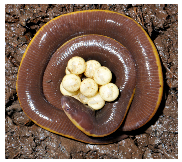
A mother caecilian coiled around and guarding her eggs. "This is a remarkable example of parental care. This mother continues to be curled around these eggs till they hatch, presumably without eating for nearly 25 days" says Biju.

SDB: Whether in Kerala or the whole of India, a host of young researchers are now studying smaller, previously overlooked forms of life. Several are excelling in their subjects of expertise, including taxonomy, and are contributing to