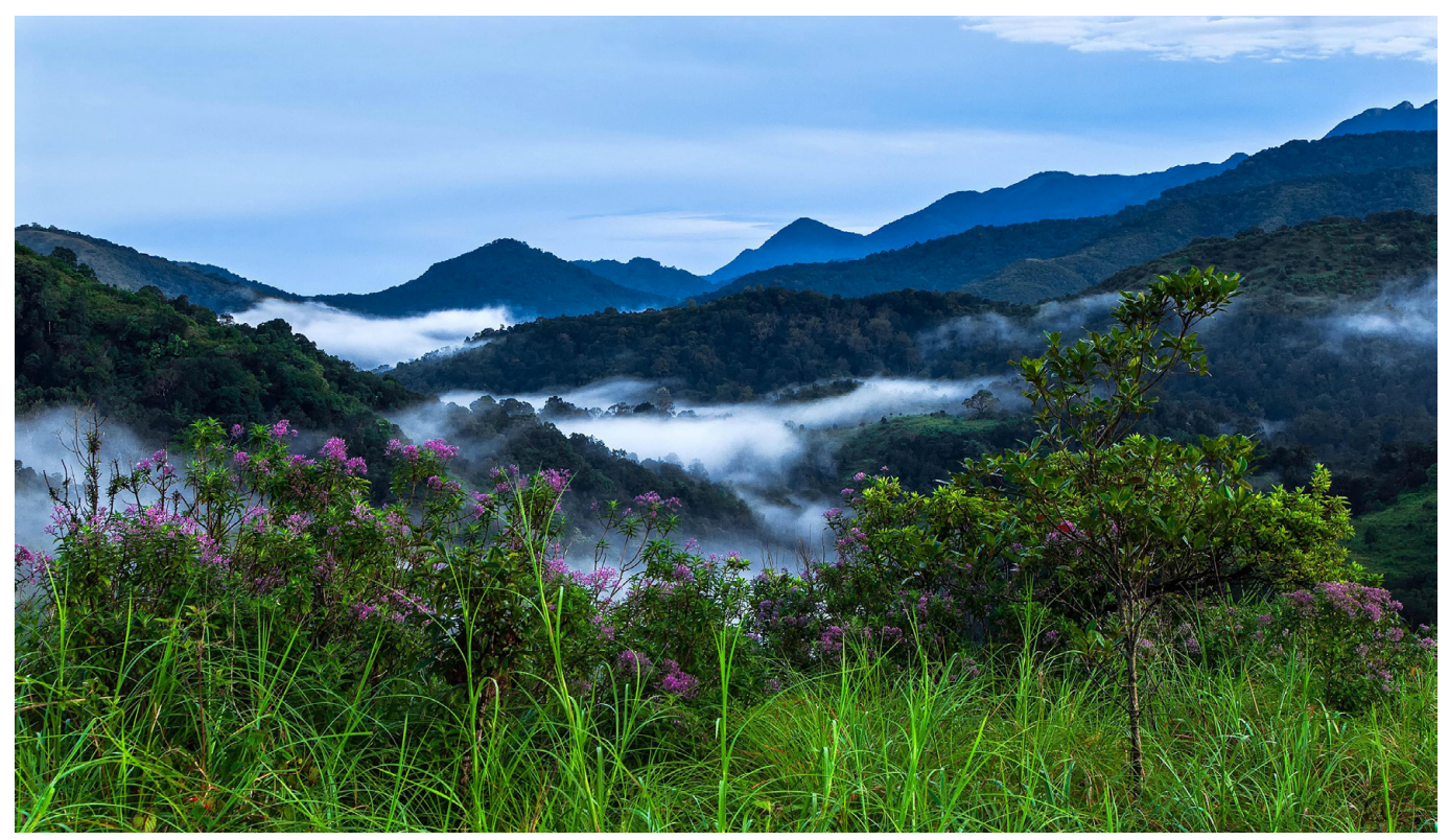
The iconic Silent Valley National Park of Kerala in the southern Western Ghats, part of a leading biodiversity hotspot and centre for global amphibian diversity and endemism. "I love my country primarily because of its rich biological diversity inhabiting a wide range of ecosystems and forest types, right from tropical evergreen rainforests to ice-covered mountains and deserts."