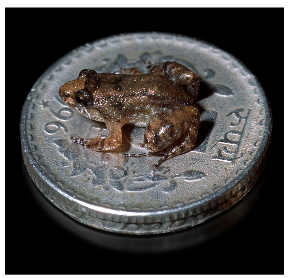
India's smallest frog (Miniature Night Frog, Nyctibatrachus minimus ) sitting comfortably on an Indian five rupee coin, was another species discovered by Biju and co-researchers.

Second, "I needed a laboratory space in Delhi as well as funds for setting it up." Both were readily offered. An excellent molecular lab and related paraphernalia came next. That was the beginning of the Systematics Lab (https://www.frogindia.org) at